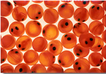
Eyed Lake Trout Eggs