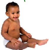
March 3, 1840