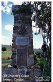
Chief Joseph's death September, 21, 1904

He was moved to Quapaw Reservation in Oklahoma